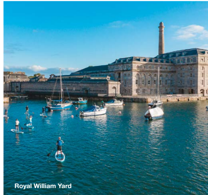
Royal William Yard