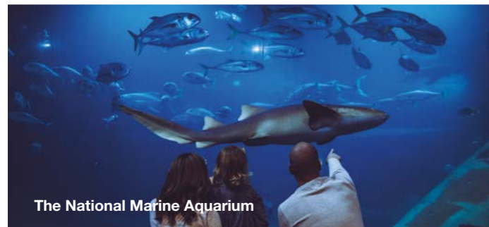
The National Marine Aquarium