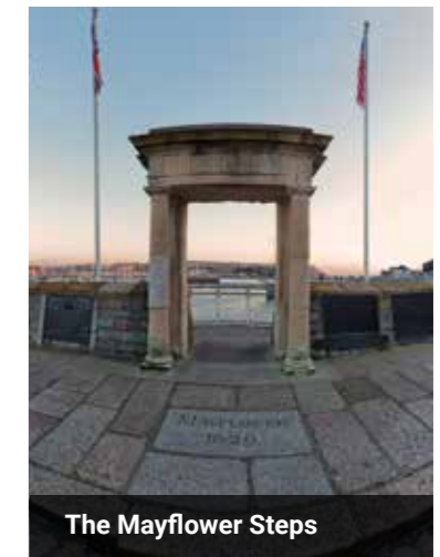
The Mayflower Steps

From the Port of Plymouth, visitors can explore the historic city with its spectacular sea views, which lies in the South West of England, UK, providing a gateway to the stunning coastlines of Devon and Cornwall and the natural beauty of Dartmoor National Park. It has the perfect blend of vibrant city culture, coast and countryside.