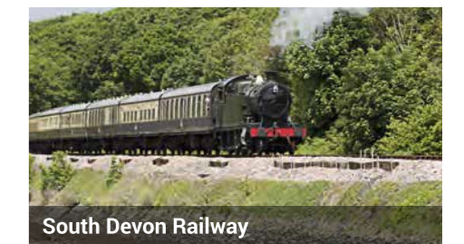
South Devon Railway

(2 hours approx.) The multi-award winning South Devon Railway is one of Devon and the West Country's best loved tourist attractions and is the longest established steam railway in the south west.