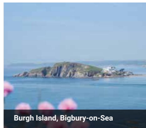
Burgh Island, Bigbury-on-Sea